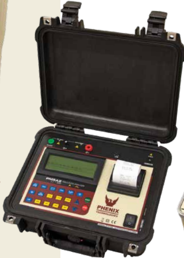
Model PM5A2 and PM10A