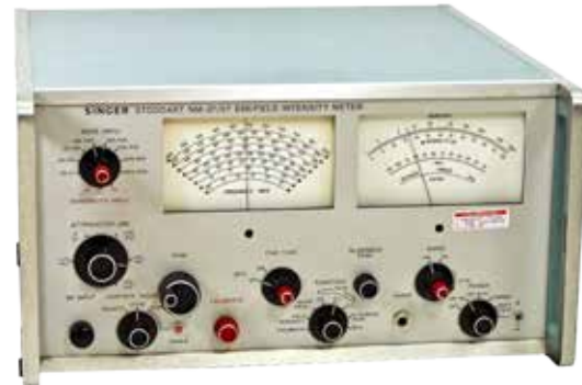
Radio Influence Voltage Meter