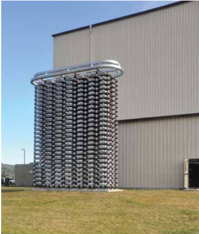
Up to 28 MVA, 300 kV f = 30 \text{ Hz} Capacitive Load Bank

In addition to this large capacitive load bank, Phenix Technologies is able to provide other high voltage capacitive loads for higher voltage ranges and lower capacitive values. E.g., C = 0.5 \dots 10 \text{ nF} up to 1.2 MV.