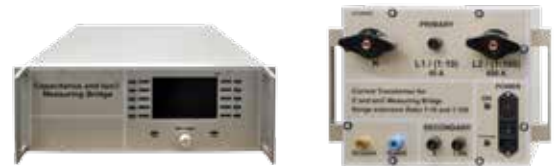
100 kV SF 6 Gas Insulated Standard Capacitor and tan \delta -bridge