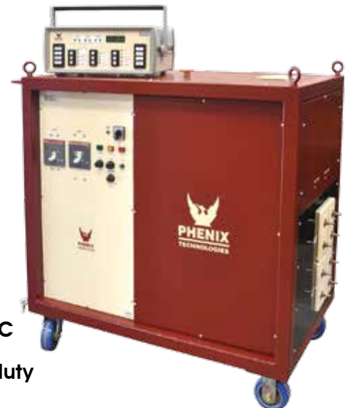
Model HC75C, 75 kA AC for up to 60 cycles and 7500 AAC continuous duty

Phenix Technologies is able to calibrate current transformers up to 2.8 kA AC with an uncertainty 0.01% for ratio, and \pm 1.2 minutes phase displacement. This is possible with a high accuracy measurement bridge utilizing zero flux current transformers.