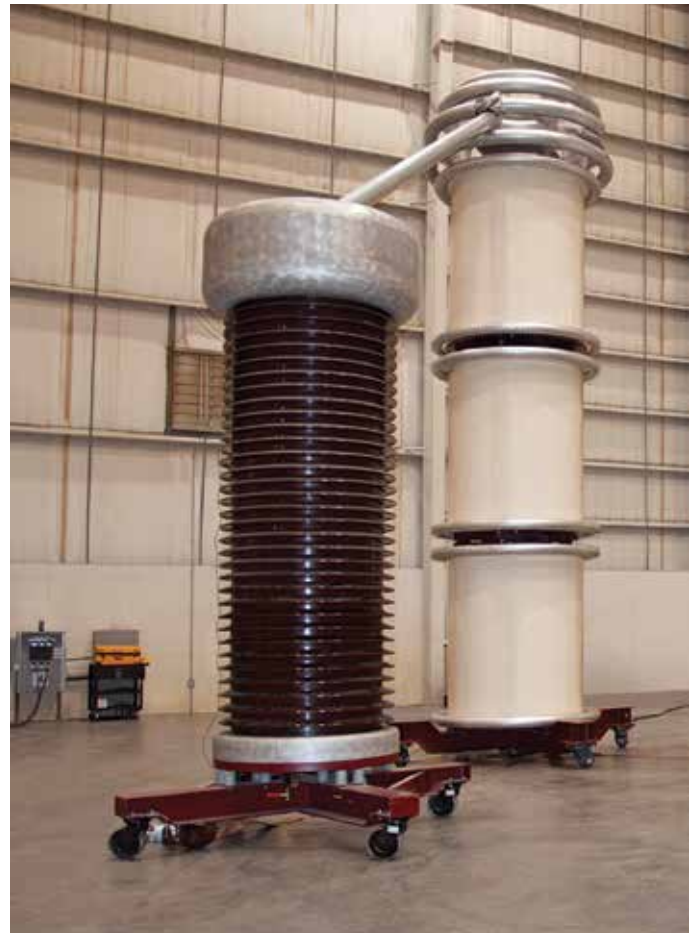
800 kV SF6 Gas Insulated Standard Capacitor and 750 kV AC High Potential Transformer

Phenix Technologies can provide a PD-free high voltage up to 750 kVAC at 50 or 60 Hz. Phenix's indoor high voltage test hall with a ceiling height of 70 ft (21 m) can easily handle large high voltage components up to 40 US tons (36 metric tons) in mass. The uncertainty for voltage measurements is less than 0.3%.