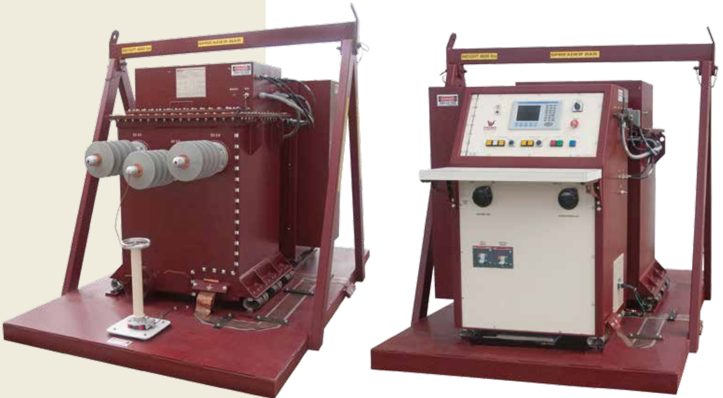
RTS 25, 40 and 50 kV, 500 kVAr

This high voltage test set can be used to apply an AC high voltage for testing capacitive loads. Therefore, it is excellent for testing insulators, capacitors, overhead lines, high voltage switches, cables, motors, and generators. This test set consists of a control panel, variable voltage source and high voltage reactor with three different high voltage taps (25, 40 and 50 kV). This unit is rated for 500 kVAr at 50 Hz, and 415 kVAr at 60 Hz, with a duty cycle of 5 minutes ON and 15 minutes OFF. E.g., it is possible to test a cable at 50 kV and 60 Hz up to 6 miles (10 km) length.