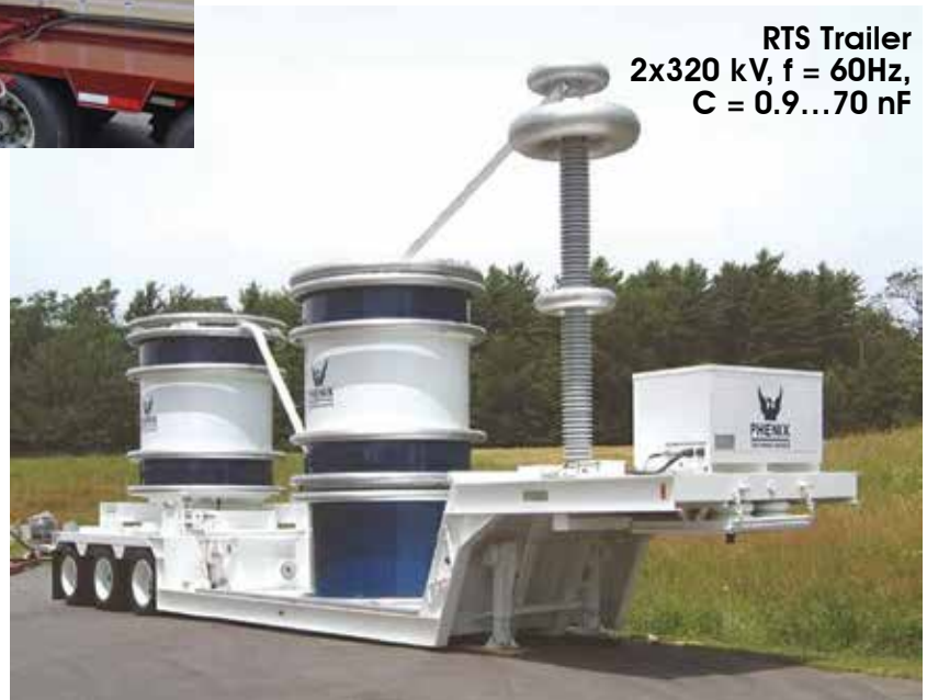
RTS Trailer 2x320 kV, f = 60Hz, C = 0.9...70 nF

This mobile test set is a variable high voltage inductor. That means constant frequency, but the inductance can be adjusted to resonance. Each module can provide 320 kV and 4.2 A at 60 Hz; for a total output power rating of 2.7 MVA. In parallel module connection, it is possible to test a capacitive load C = 3.5 \dots 70 \text{ nF} , up to 320 kV. In series module connection, it is possible to test a capacitive load C = 0.9 \dots 17.5 \text{ nF} , up to 640 kV. The unit is rated for a duty cycle of 1 hour ON and 1 hour OFF.