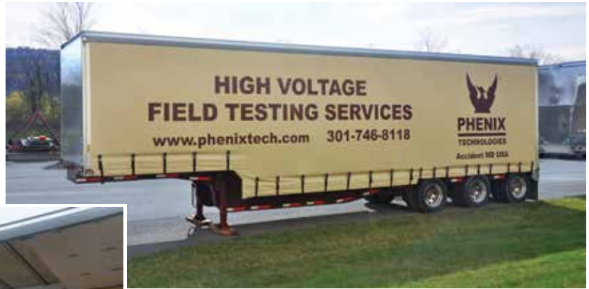
VRTS Trailer 16 MVA, 225 kV, f = 25...300 Hz