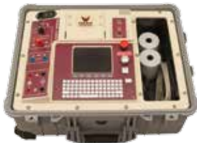
Winding Resistance Measurement

The model PATTR-03D three-phase, automatic turns ratio and phase displacement meter has outstanding accuracy and is easily integrated with the testing software for complete remote control and data acquisition. For detailed specifications, refer to PHENIX brochure #20900.