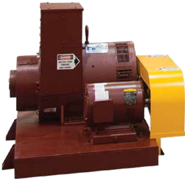
Motor Generator Set for Induced Potential Testing