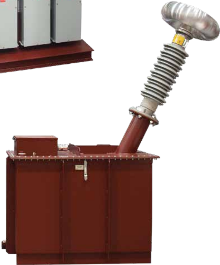
Hipot for Applied Potential Testing

PHENIX offers a complete line of AC dielectric transformers with a variety of ratings available to meet any need. Applied potential testing is necessary to verify insulation integrity in reference to ground. PHENIX can also integrate an existing hipot with a transformer test system. For detailed specifications, refer to PHENIX brochure #60404.