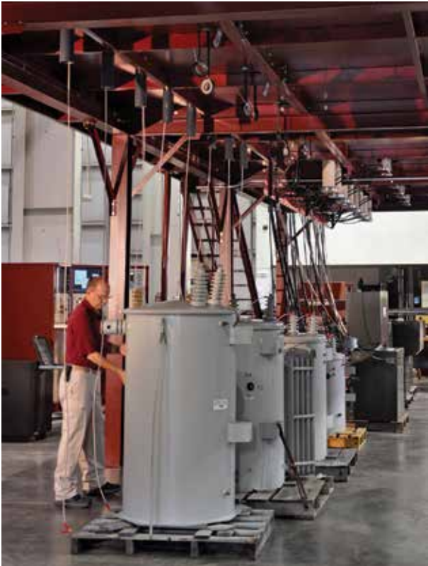
Automated Distribution TTS