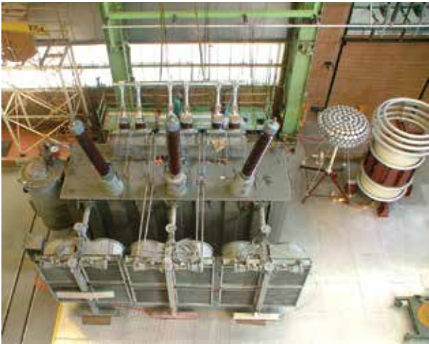
Large Power TTS