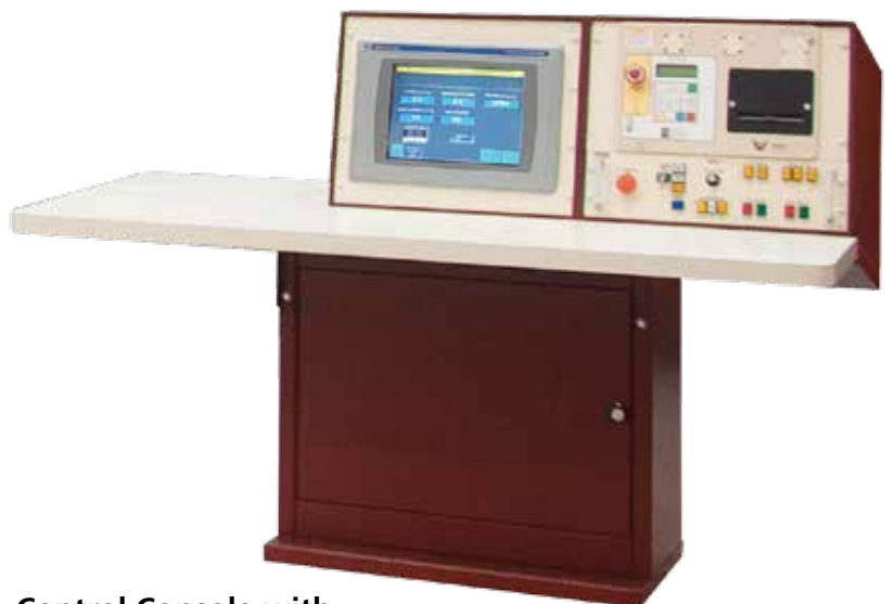
Control Console with rack-mounted Turns Ratio Meter

PHENIX offers an optional remote console that contains all instrumentation and controls. This option will allow the controls to be placed in protected area or climate-controlled room. For detailed specifications, refer to PHENIX brochure #90103.