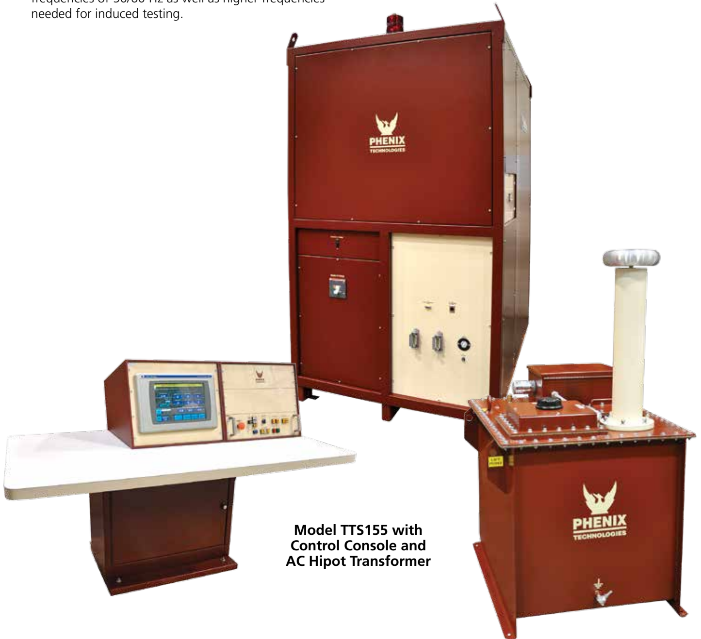
Model TTS155 with Control Console and AC Hipot Transformer