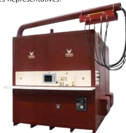
Model MTS1000R-800 with Swivel Boom