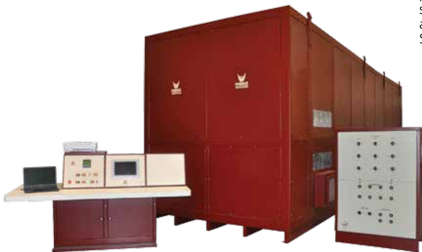
MTS R2 Series Model MTS5000R2-1000

The following information will assist you in choosing the power supplies, features, and options for a motor test system that meets your specific needs. For additional assistance, please consult one of Phenix Technologies Sales Representatives.